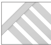
White RAL 9016